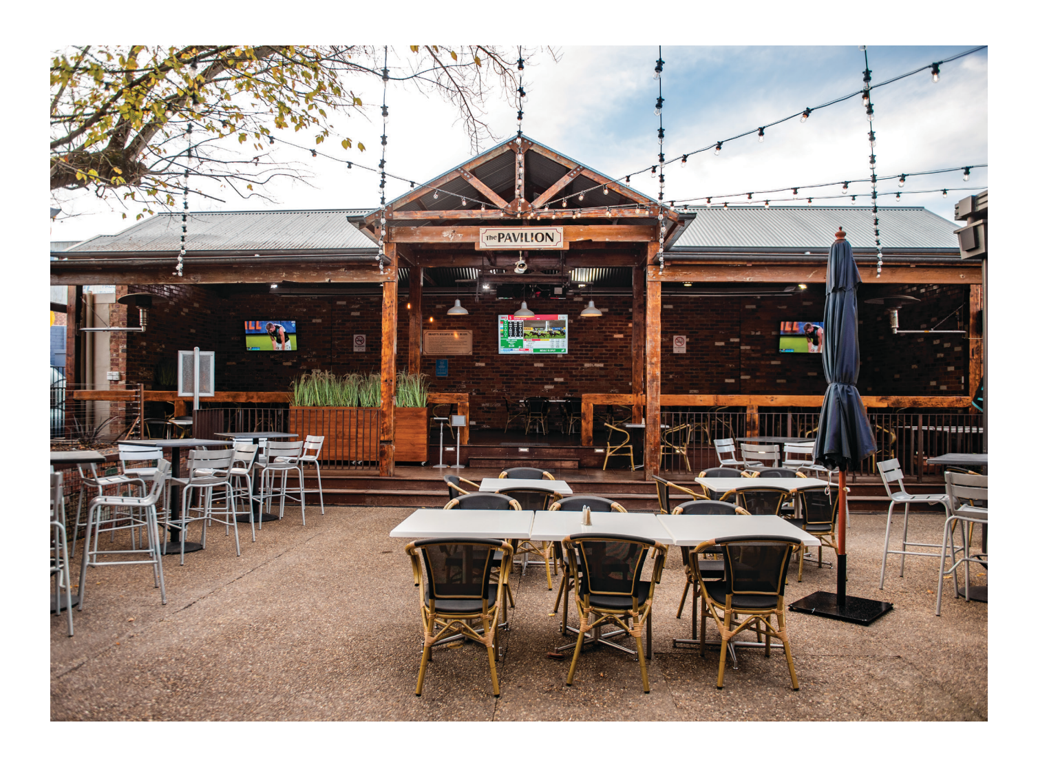
Under 50 guests will require a minimum spend of $1,500